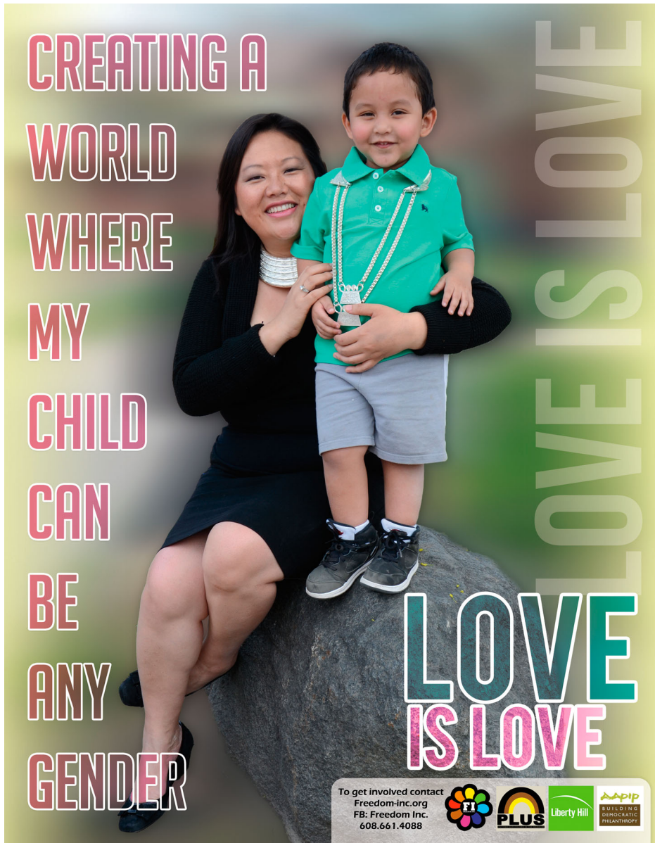
Figure 2. This poster was created to inspire conversation about how Hmong families could be accepting of gender non-conforming children.

were conversations they had often found too difficult or thorny to initiate in the past, but that this project gave them language for beginning to tackle these issues within their youth groups and in the larger communities. This is a markedly different outcome than would be achieved from simply hanging the posters throughout the community without the component of facilitating personal conversations about the images.