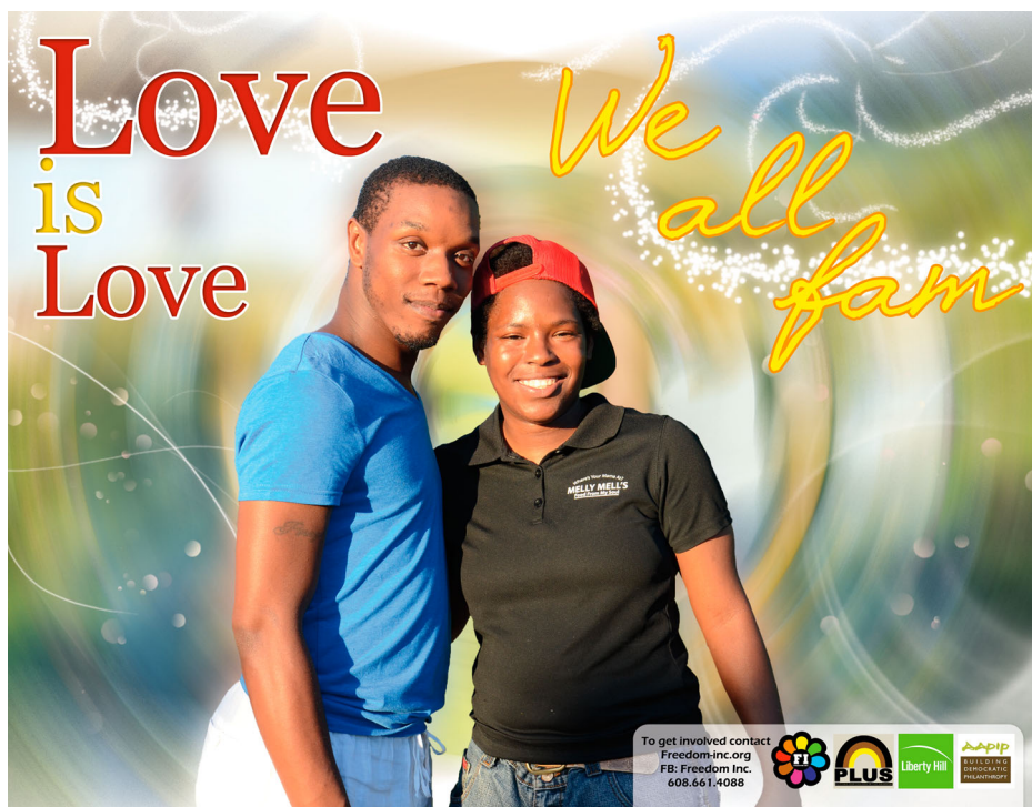
Figure 3. This poster's message was found to be ambiguous, and some community members were not comfortable with its portrayal of male-presenting members of the queer community.