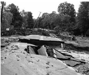
Sauk County highway crews responding to disaster sites in June photographed the damage they found. The photos are an important element of the record used in cost recovery.

"With FEMA, having good records is the key to everything. Nothing gets done without it."