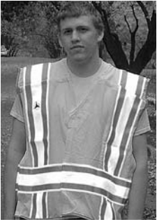
Reflective vests must meet ANSI requirements.

“Worker” refers to those on foot whose duties put them in the right-of-way of a federal-aid highway.