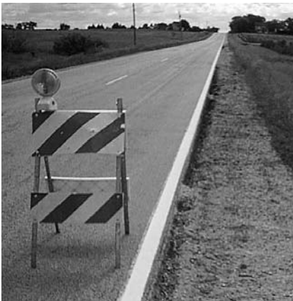
Emergency highway aid programs differentiate between MAJOR DAMAGE, like the condition of the washed-out road TOP, and damage defined as HEAVY MAINTENANCE, depicted BOTTOM by shoulder erosion from flood-waters. Major damage qualifies for reimbursement; heavy maintenance does not.

"It's challenging to stay on top of every detail when deploying resources quickly in the aftermath of a storm event," Fasick notes. "But it makes a difference in the long run if you can stay organized and separate costs by site and activity."