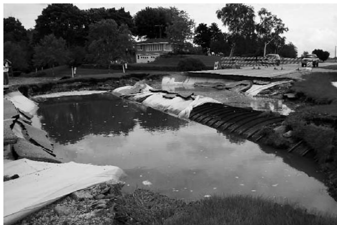
An example of serious damage to road infrastructure from Wisconsin's storms of summer 2008.