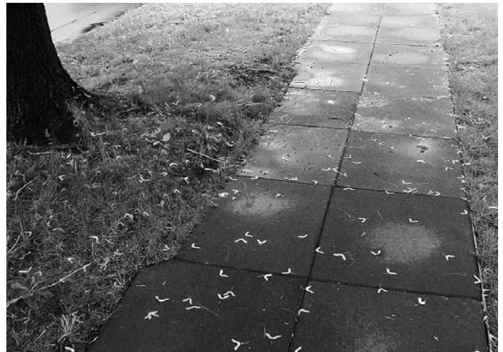
Rubber pavers make room for a large terrace tree along a section of sidewalk, part of a 2006 City of Poynette replacement project.

A year after installation, one section of new sidewalk sustained some heaving that created a trip hazard. Because of the flexible pavers, Bizjak notes, a maintenance crew is able to correct the problem easily by lifting the