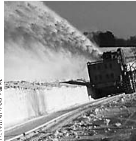
OZAUKEE COUNTY HIGHWAY DEPARTMENT

For issues like parking and sidewalk shoveling, translate relevant ordinances into simple language and make clear why they exist. Give people reasons behind the rules—so that snow-removal crews can do their jobs efficiently and effectively, and get safe streets open sooner—to help them appreciate how important it is to comply. Direct people to a source where they can read the complete ordinance if interested.