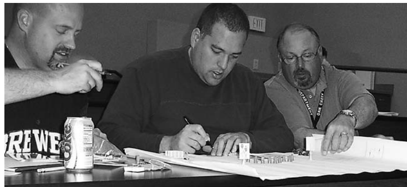
Participants in an on-site training session collaborate on practical work zone applications.

Along with the training program, TIC developed materials that reinforce best work zone practices. ►