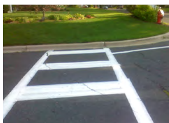
Two examples of crossings that need updating to improve pedestrian safety and accessibility. Agencies can make the improvements as part of a planned alteration or on a Transition Plan schedule.