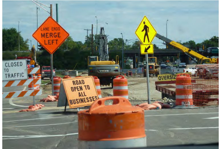
Warning signs and barriers designate a location where workers must listen and watch out for construction vehicles backing up.

Rank recommends that public road agencies incorporate these rules into their standard operating procedures, much like fire and bus transit departments do. "Some of them have it in writing, for example, that no one ever does a backing maneuver without a spotter."