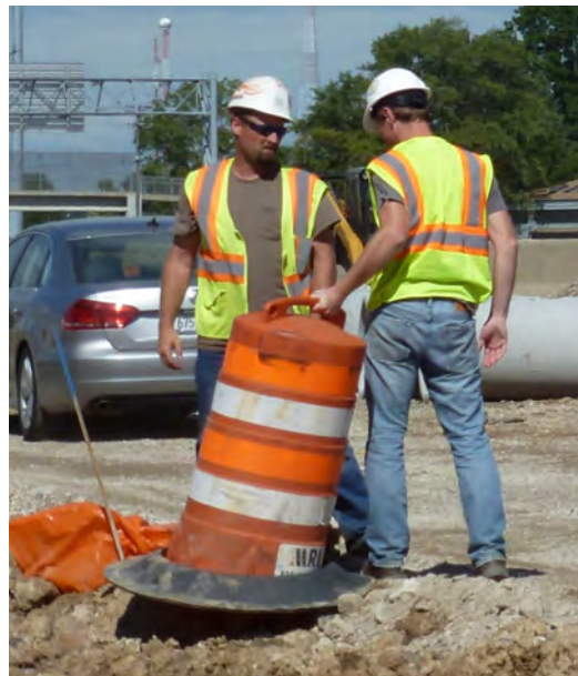
Training for everyone who does their job in a work zone should include how to prevent vehicle-backing accidents.

According to the National Institute for Occupational Safety and Health (NIOSH), construction vehicles pose a substantial safety risk to the men and women that build and maintain the nation's road network. Like public works equipment yards and garages, work zones present local governments with a safety challenge. But by instituting and enforcing safe vehicle backing practices, public road agencies can and do prevent death, serious injury and substantial property damage. ●