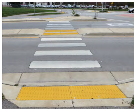
Curb ramps with detectable warnings improve pedestrian safety and accessibility at all crossings.

Association of Bicycle and Pedestrian Professionals offers technical help and courses on design of accessible facilities.