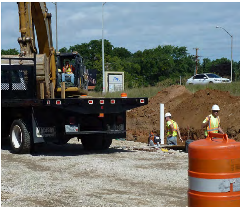
Workers on foot must stay alert to backing maneuvers when there is heavy equipment operating in work zones.