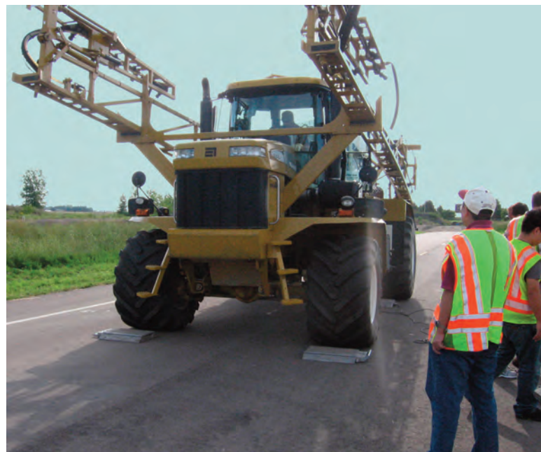
The road researchers used portable scales to measure the weight of all study vehicles at the start of each test period, as with this double-axle applicator. It was one of two applicators tested that produced some of the highest stresses and strains recorded.