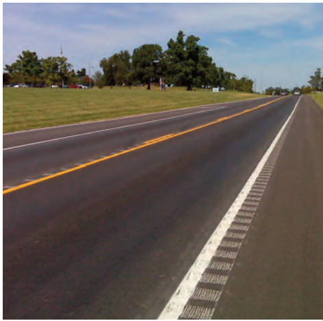
Severe run-off-the-road crashes account for a significant number of fatalities on Wisconsin's rural roads each year. Shoulder rumble strips, shown above, alert drivers to pull safely back into their travel lane.

Finally, because rumble strips can spook horses pulling buggies, Zogg says they will not install them on roadways in Amish communities.