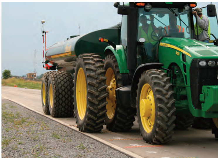
The study measured different load levels over five days of testing on the flexible pavement sections in each of the spring and fall test periods. Experienced drivers drove tankers like this one, empty and with loads at 25, 50, 80 and 100 percent capacity.

Building roads that can carry the heaviest loads without early failure is a long-term solution local governments need to consider.