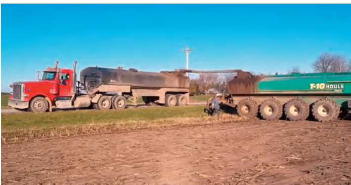
Eisentraut AG sometimes moves materials from farm to field by transferring loads from a tanker on the road to spreaders in the field, avoiding the need to drive a heavier vehicle on town roads.