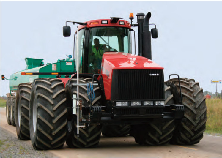
Allowing large tractor tankers transporting agricultural materials, like the 9500-gallon MnROAD test vehicle pictured here, to use temporary one-way routes during hauling operations can protect town roads from serious damage.

“New design and construction methods have started to answer this need but they come along at a time when revenues cannot keep up with the cost of updating a road,” Schnell says. “It’s a real challenge.”