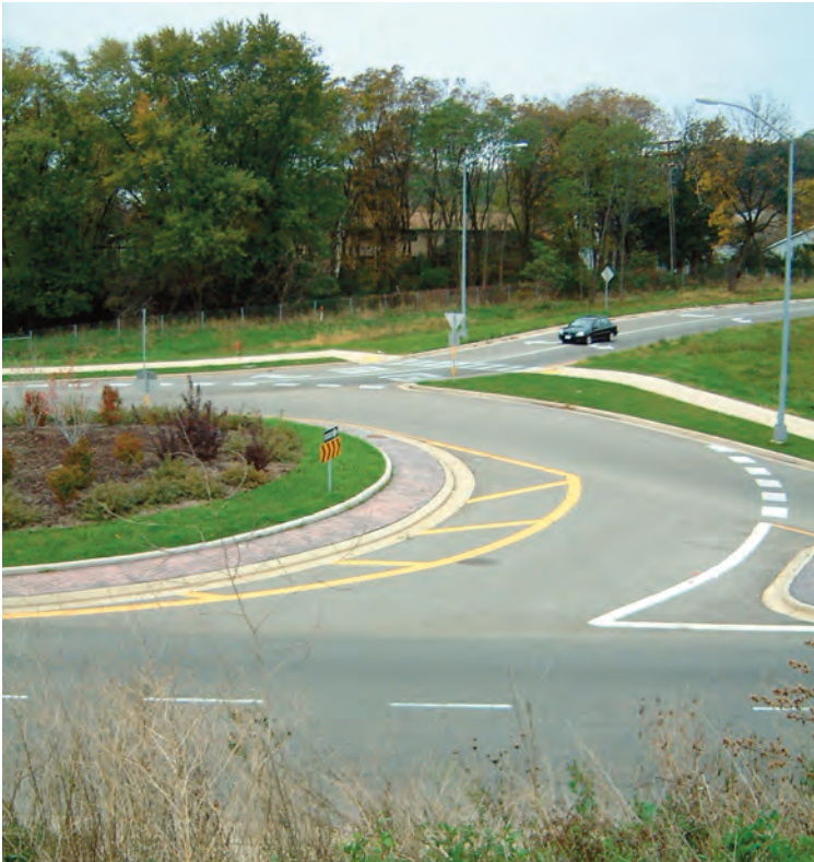
Converting a signalized intersection to a roundabout helps slow traffic, reduce conflict and improve safety.

“The crash data is good but has its limitations,” Bill explains. “By looking at other factors, we get a realistic picture of the true impact of an improvement and its value from an economic perspective.”