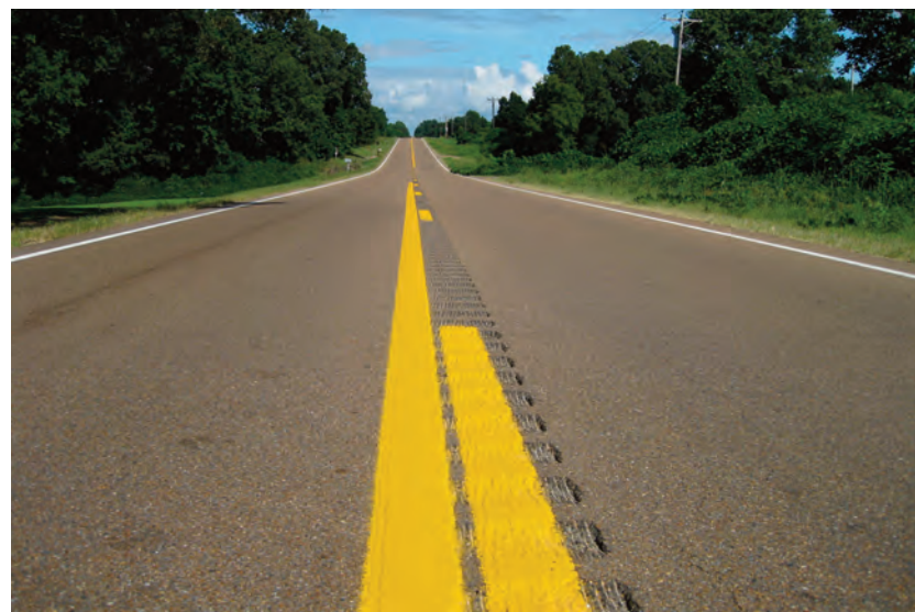
Centerline rumble strips on two lane roads, like this example from Mississippi, can reduce fatalities and injuries from head-on and sideswipe crashes by 44 percent.

Noise was an issue since the sound tires make on rumble strips can carry. For that reason, WisDOT tried to avoid locating projects in close proximity to residential areas.