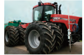
The tests took place in the spring and fall, times of the year when pavements often are at their weakest and the movement of farm equipment is heaviest.