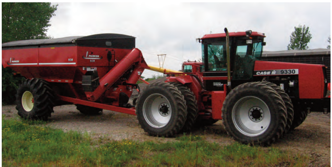
Testers compared farm vehicles like this single-axle grain cart, loaded and empty, to measure pavement deflection and other results. The study found that individual axle weight mattered more than gross vehicle weight in causing pavement failure, suggesting the more axles, the better.

A method that circumvents town roads completely involves pumping the manure through pipes or flexible hoses threaded along ditches or running underneath roads. Some towns and counties in Wisconsin are starting to install dedicated under-pavement pipes or culverts to facilitate this type of transport.