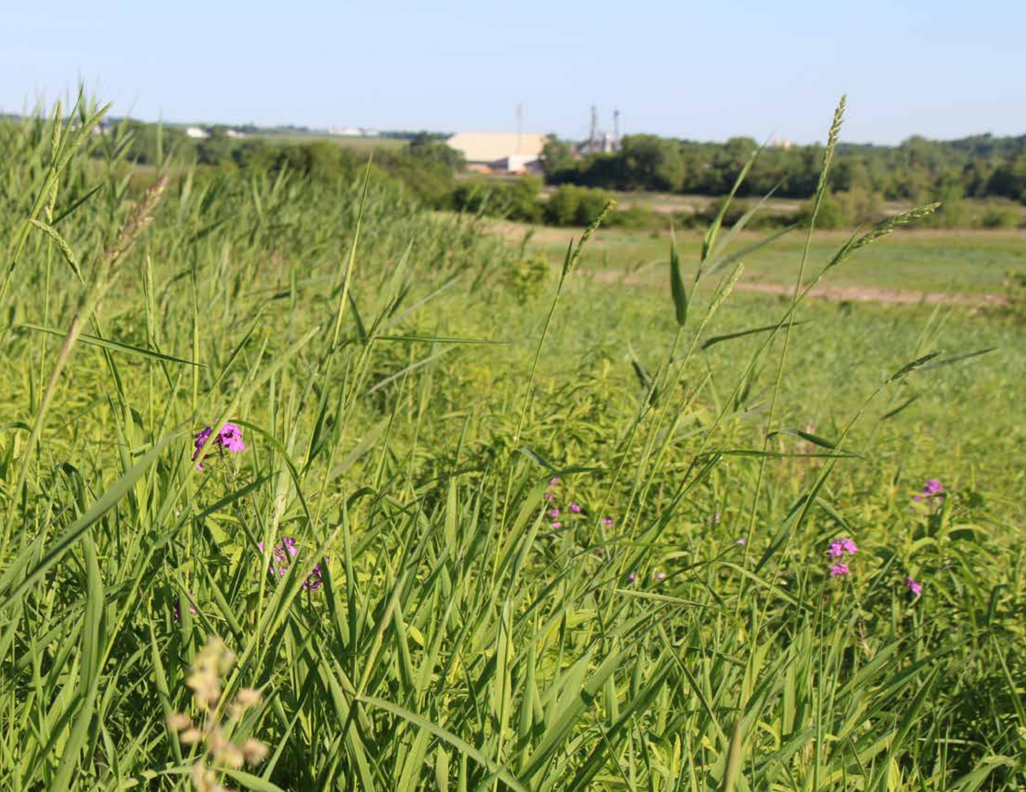
Dorn Creek runs along farmland in Dane County.

For more information about the request for proposal process, please visit our website at univercity.wisc.edu or email our staff at univercityalliance@wisc.edu .