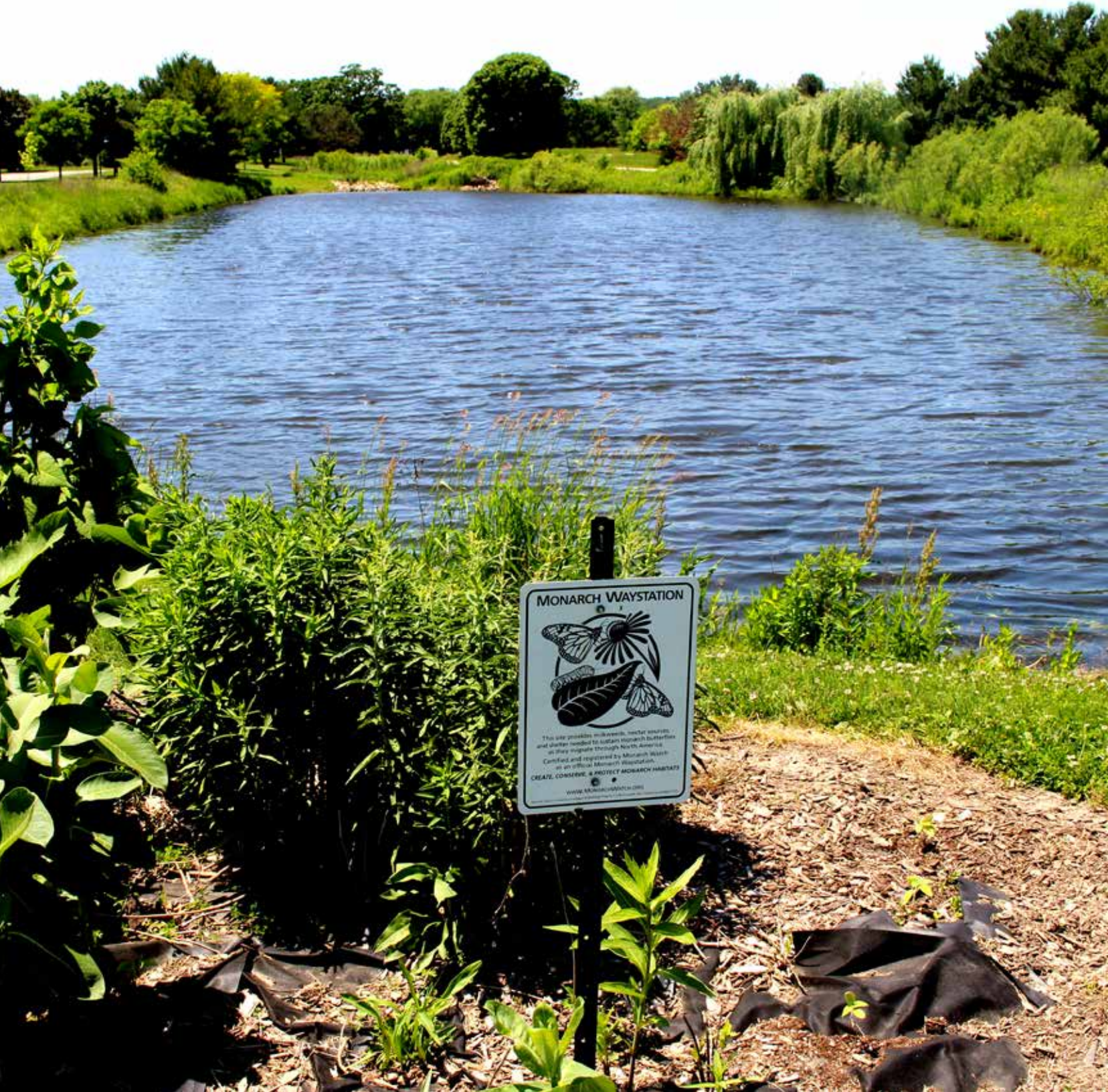
A retention pond in Fitchburg helps control runoff to the surrounding neighborhood.

The Dane County Board of Supervisors, made up of 37 elected representatives, makes policies, enacts ordinances, levies taxes and appropriates money for services.