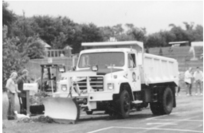
At the snowplow rodeo drivers guide their plows through an obstacle course and take a written exam.

Where: Waukesha County Fairgrounds. Just off I-94 on CTH T.