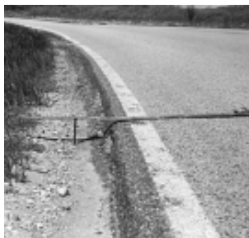
This drop-off is over five inches deep and is a hazard. Drop-offs commonly occur along the inside of curves and at intersections.