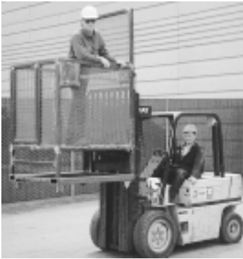
This forklift mounted cage makes working in high places safer.

How many maintenance workers does it take to change a light bulb? The answer is no joke when the bulb is 30 feet up in the ceiling of a maintenance garage. Changing light bulbs is just one of the hazardous tasks made safer by a forklift-mounted cage built by the Portage County Highway Department.