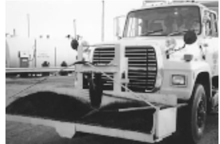
It's easier on the back and safer to patch small potholes from this front-mounted cold mix holder.

The pan is built around a snowplow hitch and can be mounted and dismantled as easily as a