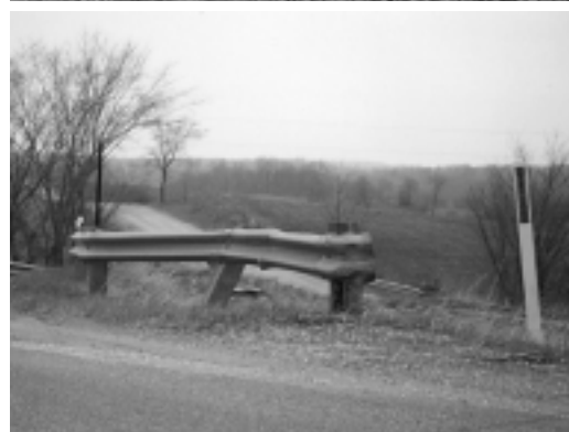
Short portions of rail are not as effective or able to restrain a large vehicle as longer ones. The guardrail in the bottom photo seems to be needed. Both need repair and are a hazard in their current conditions.