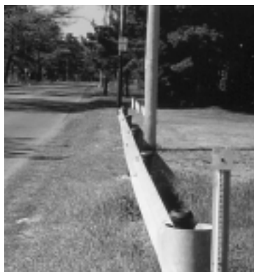
Beam guardrail will deflect several feet before it restrains a vehicle. This installation is dangerous. Also, there does not appear to be a good reason to install guardrail at this location.