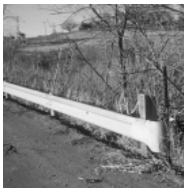
This rail is too low and could cause a vehicle to roll over. A minimum height of 27 in. to the top of the rail is recommended. Also, the blunt end can be hazardous. In addition, the intermediate posts are missing. Posts should be spaced at six feet three inches apart. Upgrading the guardrail is desirable if it is to be effective.

Severe drop-offs at the edge of pavements are also a hazard. Drop-offs as small as two inches can be a hazard for high speed traffic. They can occur when the pavement is overlaid and additional shoulder material is needed to match the new road cross-section. Traffic or water action can also cause shoulder drop-offs.