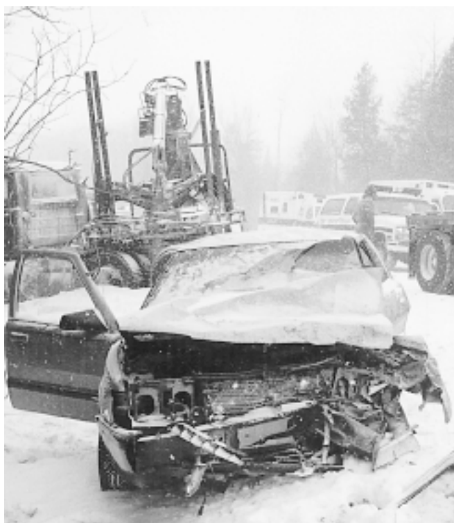
Reviewing crashes is one of the jobs of County Traffic Safety Commissions