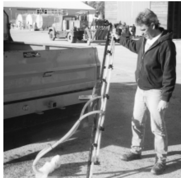
Jefferson County built its own double spray bar to apply mag chloride to bridge decks.

equipment. In cooperation with Monroe Truck Equipment, they are investigating improved spreader controls, on-board pre-wetting and anti-icing equipment. They are also working on ways to reduce blowing snow around snow plows (the so-called white cloud effect), and to improve safety through lighting equipment and improving driver safety.