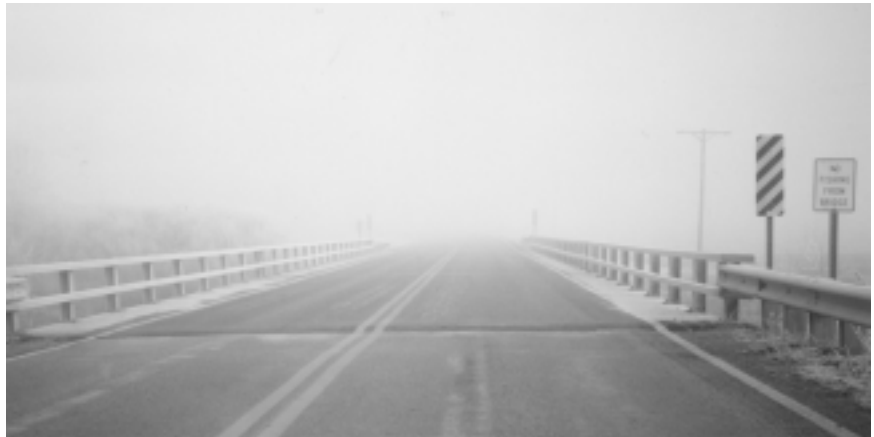
Icing on bridge decks is a frequent problem. Spraying liquid magnesium chloride can help prevent it.

WisDOT is also working with several counties on developing a winter maintenance "concept vehicle" to test new snow removal