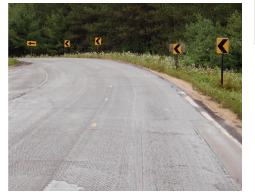
A better position for the large arrow sign at left is in the line of sight for an approaching driver, or about where a chevron is missing in this photo. Another solution on curves like this is to install a series of chevron signs only. Use the MUTCD as a guide for placing road signs correctly.