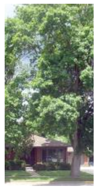
Homeowners plan to pay for treating this ash on the public terrace near their property, an option Sparta gives residents who want to extend the life span of a mature tree.

"The inventory allows us to identify trees to be removed, track the progress of our various programs and may help us spread out future removals."