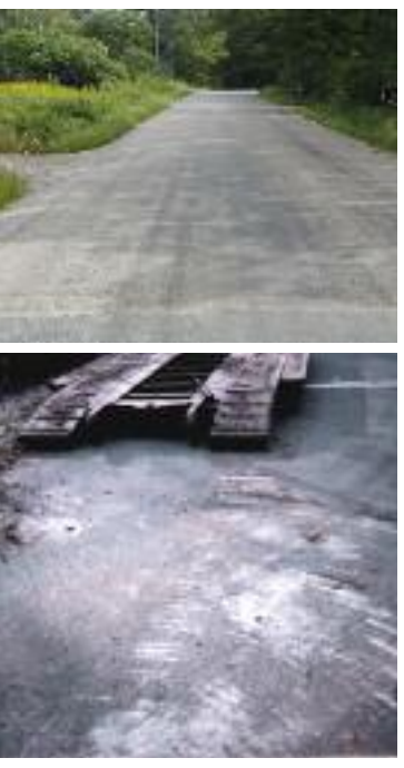
Before and after photos of a town road show the damage done by a contractor unloading heavy equipment. Following permit requirements, the company reimbursed Hull for the cost of repairs.

The ordinance allows 24-hour turnaround for issuing a permit but in cases where Brilowski is familiar with a company's equipment, their weights and what they haul, the process goes faster. "We turn most permits around quickly so truckers can be on their way," she says.