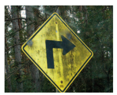
Tree sap and shots from a paint ball gun make this TURN sign difficult to see both day and night.

According to reports from the Circuit Riders, many town roads in Wisconsin are short on advance warning signs at horizontal curves and at intersections to inform drivers of a dangerous condition. Research nationally on low-cost safety improvements shows that having warning signs at curves and turns and at intersections helps reduce road crashes, especially at night. Pudloski will review these and other findings at the workshop sessions and present examples from around the state.