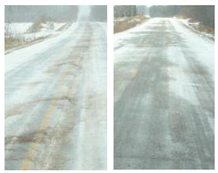
During a February snow event with high wind conditions and road temperatures of 18 degrees F, Polk County Highway Department compared results on a county road treated with salt sand (500 lbs per lane mile), left, and another where the plow operator applied salt sand (300 lbs per lane mile) with dairy brine, right. The brine helped the application work better, faster and at lower amounts.