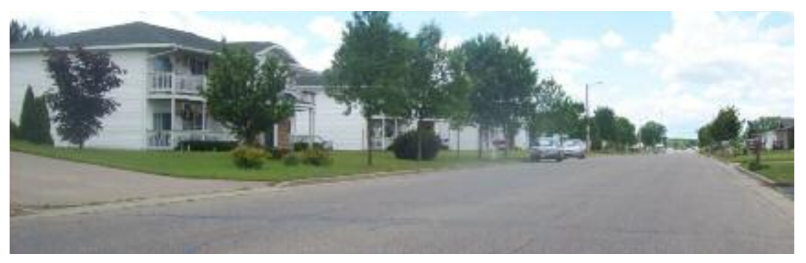
Planting a single kind of public tree runs the risk of losing every one at the same time when the species succumbs to a tree disease like EAB. When the expected borer infestation kills this row of young ash trees in a Sparta neighborhood, the city will replace them with a more diverse mix of trees.