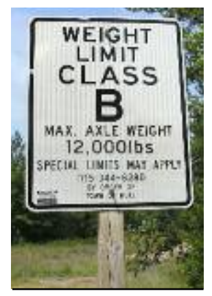
Signs posted on every Town of Hull road alerting drivers to the weight limit rule are part of a proactive effort to educate haulers and improve compliance.

The ordinance requires that trucks traveling to or from a location in Hull with loads that exceed the limits apply for a permit and work with town officials to determine a suitable route.