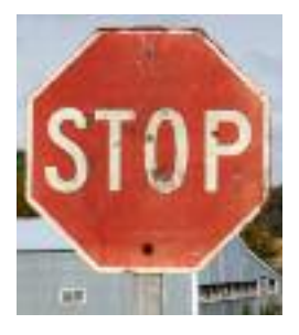
Faded and with little or no retroreflectivity, this STOP sign is past due for replacement.

Locating, inspecting and recording information on all traffic signs helps set realistic priorities and budgets during the phase-in period for bringing signs into compliance.