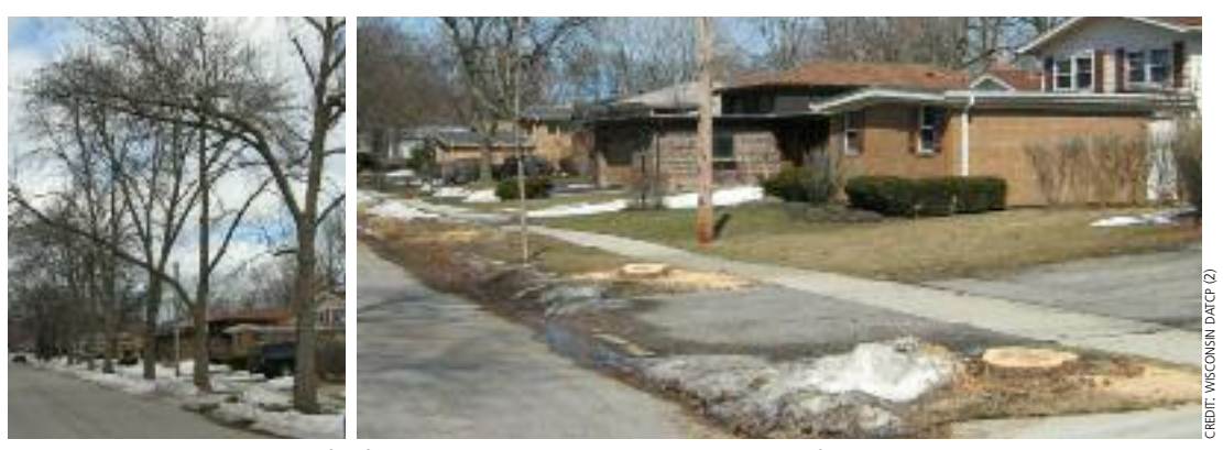
The need to remove a row of infected ash trees on a residential street, left, leaves a stark landscape, right.

EAB, existing regulations, management options, other resources and ongoing statewide efforts.