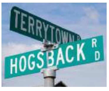
Replace all-uppercase lettering on post-mounted street name signs, like this one, with a combination of uppercase and lowercase letters by January 2012.

– Make sure all street name signs meet minimum retroreflectivity standards.