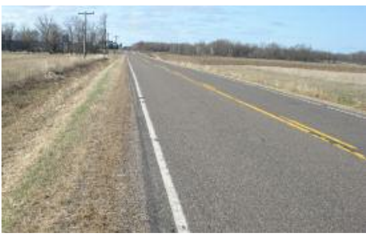
Norby monitored the roads used in the pilot for deposits of salt brine in the spring and found no residue on the pavements test treated

During the pilot, the county stored the dairy brine in two 6,000-gallon tanks where plow trucks came to fill up before a snow event. They plan to store in tanks at outlying sites as they expand application of the prewetting material.