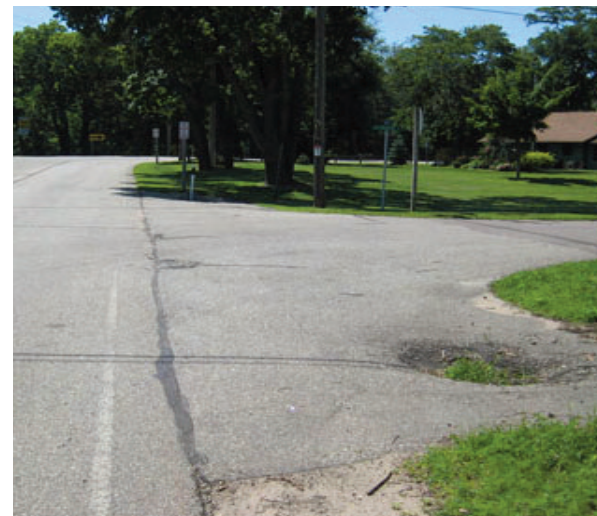
A Town of Campbell safe routes committee proposed installing more school zone signs and traffic controls along this route to school.

She helped organize a committee that included town officials, the chief of police, parents, teachers and school administrators. They drove and walked the route taking notes on problems and solutions, and explored how to align their efforts with pedestrian safety initiatives already in place through the city and county. A consulting firm will help with design of the project.