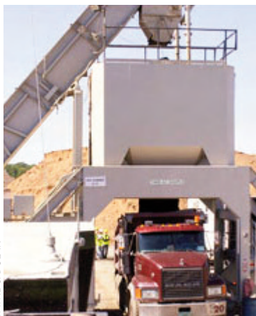
PAYNE & DOLAN