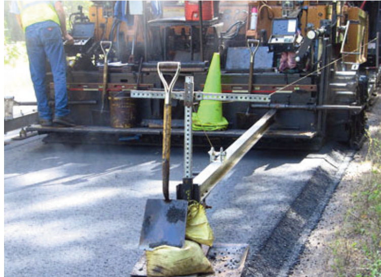
Paver advances on the STH 55 project, producing the Safety Edge as it goes.