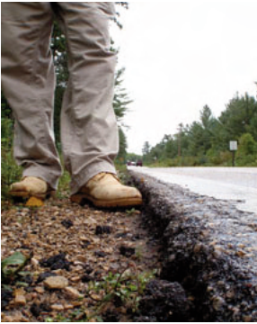
Vertical edge on STH 55 before any milling took place, a drop of about two inches.

There are potential advantages to making the low-cost improvement on narrow local roads with gravel shoulders that degrade over time, exposing the pavement edge and a dangerous drop off for traffic.