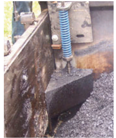
Trans Tech shoe attached to paving screed creates the Safety Edge.

Zogg says among other things, they want to evaluate the best method for achieving the final shape of the Safety Edge in the case of multiple lifts, or sequential