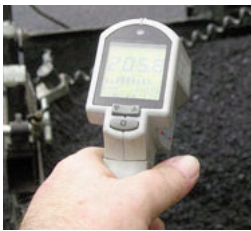
Testing the temperature of warm mix asphalt during paving.

Lower fuel consumption in production may reduce emissions by as much as 40 to 60 percent and there are fewer asphalt fumes at laydown, a particular benefit for construction crews.