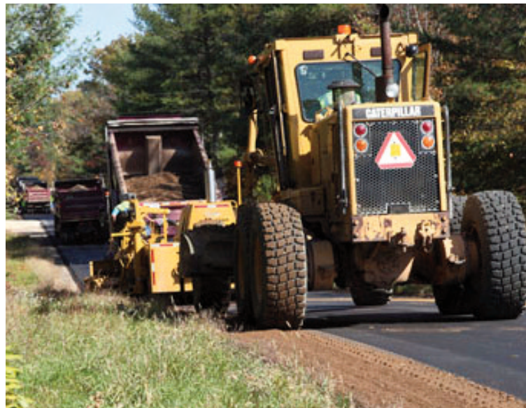
Crews place and grade the gravel shoulder on the STH 55 project, making it level with the new pavement surface and enclosing the Safety Edge.