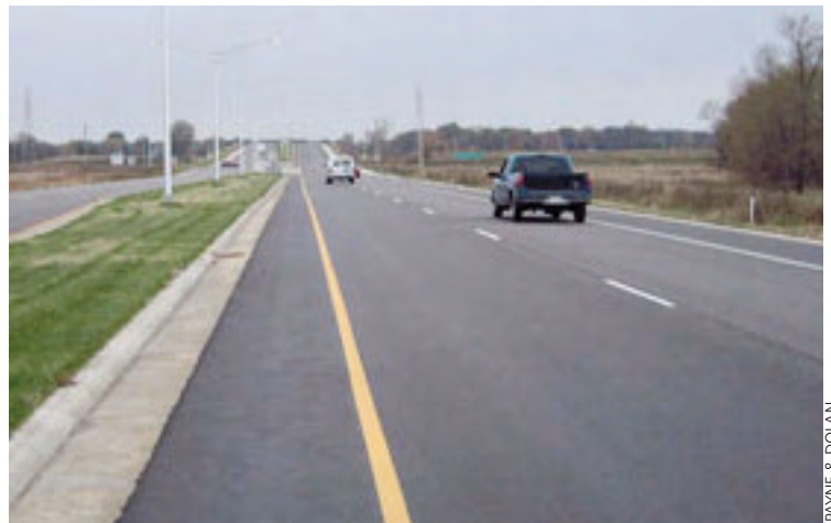
Newly paved stretch of State Highway 100. The 2006 WisDOT project compared the performance of warm mix asphalt to traditional hot mix.

Contractors in the state are offering WMA as an option and in the last two years, county highway departments in Wisconsin have started to use it on local projects.