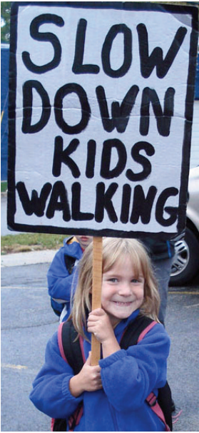
Village of Waterford's walk-to-school projects get everyone involved.

Common to all these projects is that they depend on a coalition of groups working together and local leadership to make things happen.