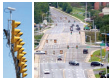
Images of accelerating technologies from the Every Day Counts website, where visitors will find information and resources on all initiatives in the FHWA project.