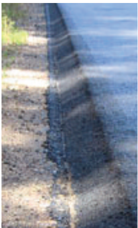
The look of the new Safety Edge on STH 55 prior to placing the shoulder.

There are potential advantages to making the low-cost improvement on narrow local roads with gravel shoulders that degrade over time, exposing the pavement edge and a dangerous drop off for traffic.