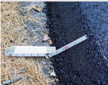
A 30-degree edge slope makes it easier for drivers who drift off the road to recover control.

Safety Edge may add between $500 and $2,000 per mile to a project. His experience with STH 55 and other on-the-road research suggests the amount of asphaltic material to construct the angled edge is almost negligible on a hot mix project, less than one percent in most cases.