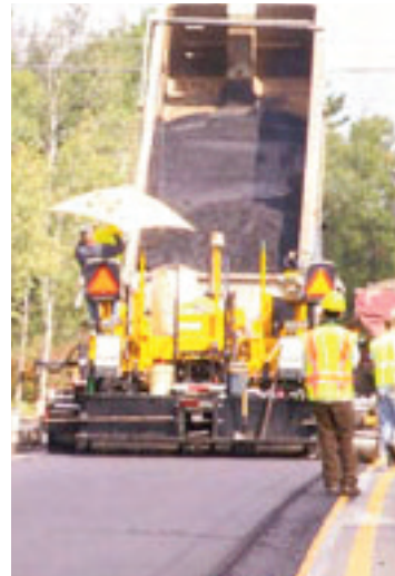
PAYNE & DOLAN