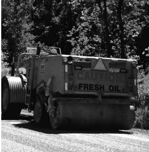
D – chip seal being compacted

Chip seals are a low cost surface treatment. Using a combination rubber-tired and steel-wheel roller (see photo D) produces a tight, durable surface.