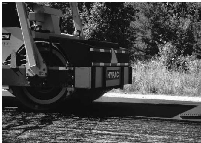
Ultra-thin overlay strengthens and smooths pavement.

Ultrathin overlays are not appropriate for severely distressed concrete pavements, pavements with a weak base, or