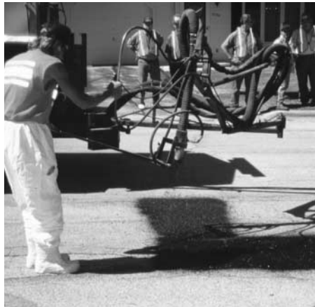
A – high pressure spray injection patching

The T.I.C. worked with the Wisconsin Asphalt Pavement Association to find the demonstration contractors and demonstration sites. Demonstrators who donated labor, materials, and equipment included: Daffinson Asphalt Maintenance, Fahrner Asphalt, Northeast Asphalt, Scott Construction, and the City of Green Bay. The City of Green Bay, the Town of Scott and the University of Wisconsin-Green Bay provided sites used in the demonstrations. Funding to make the Demonstration possible came from the Federal Highway Administration.