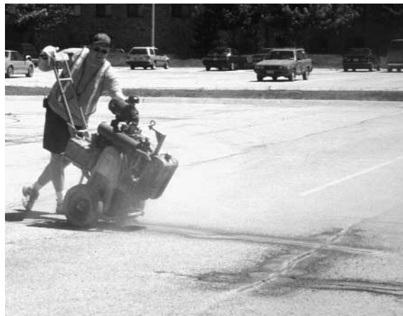
C – routing cracks for sealing

Spray injection patching ( photo A ) Wisconsin communities and contractors are finding applications for high tech spray injection patching equipment. One or two employees can operate it to produce a durable patch on both asphalt and concrete pavements. The “all-in-one” machine allows the operator to blow the hole clean, then tack and patch the area by blowing in asphalt and aggregate under high pressure.