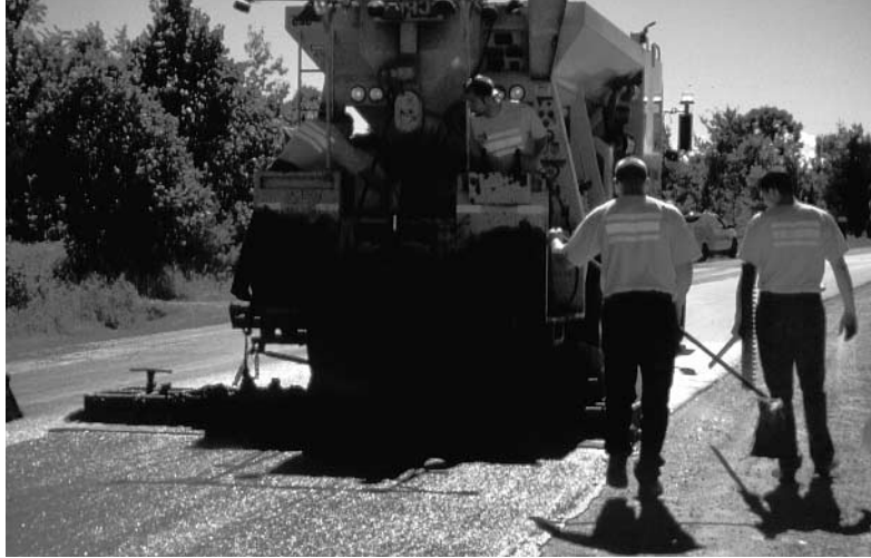
E – slurry seal

Address incorrect? Please call or write us with the correct information