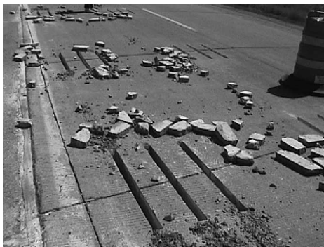
Slots cut for dowel bar joint repairs

For about 15 years, from 1972 to 1987, both WisDOT and municipalities built concrete pavements without dowels at the