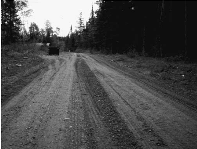
Graded road with crown allows good ride and speeds of 25 mph. Sandy surface soil.

For copies of the new PASER Manual for Unimproved Roads see resources page 2, or contact the T.I.C. using the form on page 7.