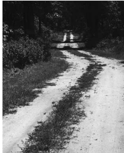
Low volume forest access. Stable surface. Comfortable ride at 10 mph.