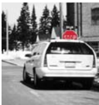
Stop sign is mounted too low.

To be effective, follow roadway design and alignment in placing signs. Mount them vertically at a right angle facing the traffic they serve. Generally locate signs on