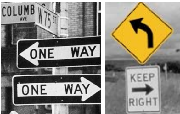
Unlike the examples shown here, signs should be clear, easy to follow and avoid confusion.

A fundamental task of local government is to provide a safe roadway system at reasonable cost. It should be one which a prudent driver, even a stranger to the area, can travel safely.