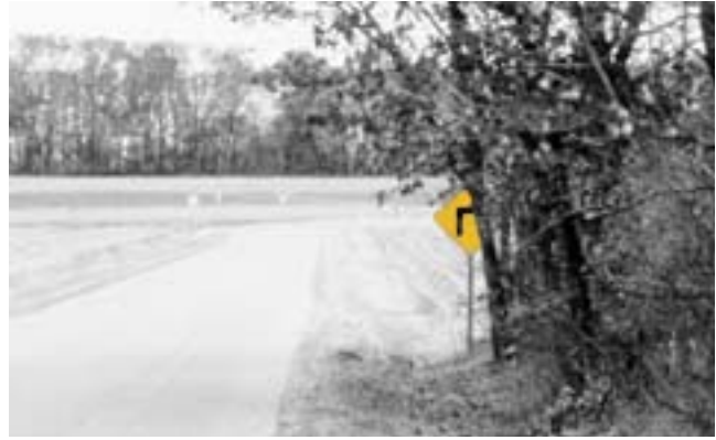
Check signs regularly to ensure they are visible to drivers.

Second, the local government should set up procedures for service and repair. Because many tort liability suits are based on whether the maintaining authority could or should have known of the hazard, be sure complaints go quickly to the proper people and that