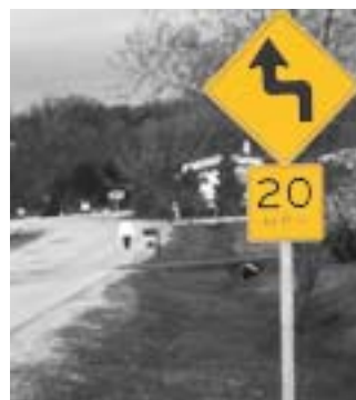
Only signs with related messages should share a post. This curve sign and speed advisory are correctly mounted and are at proper installation height and off-set.

In general you should not place two or more signs on the same post if they carry unrelated messages. Two signs with related messages can be placed together (for