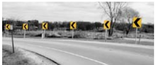
Local officials can choose from several levels of signing.