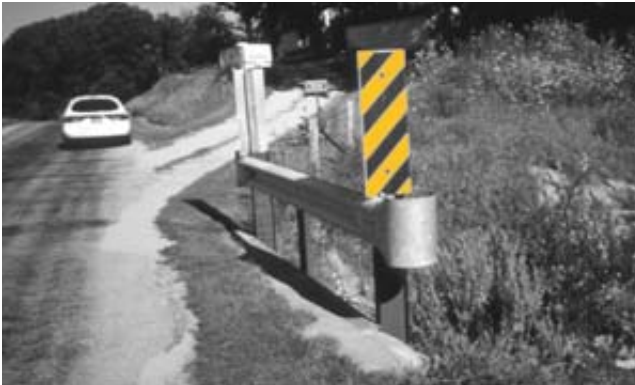
Place signs—like object markers on narrow bridges or culverts—where drivers need the information.

These signs are intended to give drivers effective information when they can use it best.