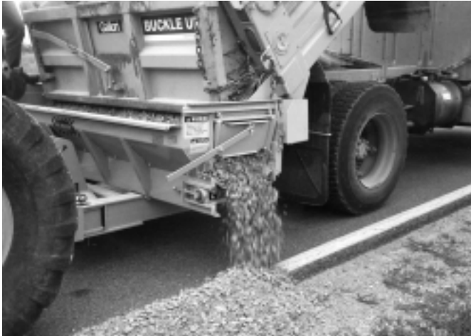
This rock spreading system is neat and efficient.

By modifying a commercial rock spreader, maintenance staff at Illinois DOT's Carlville yard have a neater, easier way to fix low shoulders along pavements. A platform built onto the front of a grader holds the spreader. It attaches to the grader's scarifying hookups and hydraulic controls.